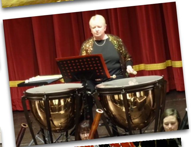
A few memories of a brilliant concert!